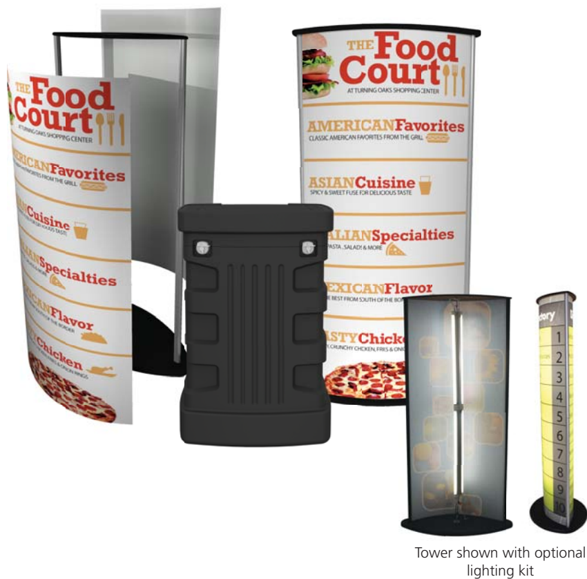
Tower shown with optional lighting kit

This cost effective, double-sided, free-standing tower features a sturdy construction and stylish design. The graphics are held under tension in a curved, eye-catching bubble position. Silver or black side extrusions are available and a backlighting kit is available to turn your tower into a light box.