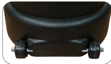
Recessed wheels and handle