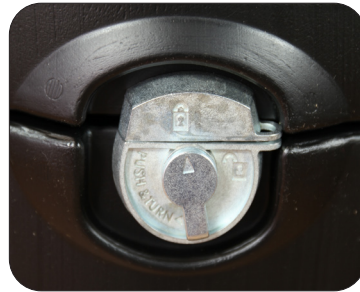
Push & turn locking mechanism