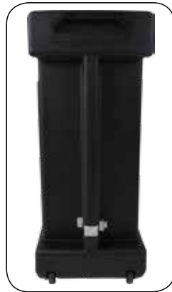
Handle and wheels