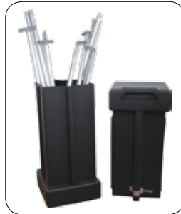
Case fits with Formulate tubes and graphics