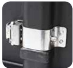
Close up of latch