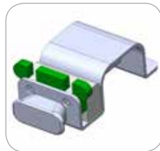
To open: pull up on lock (green)